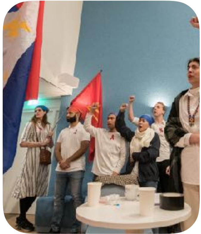
Tribute with international friends in Utrecht, December 23, 2022

The 2008 financial meltdown has developed into a global depression far more prolonged and severe than the Great